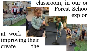
at work improving their create the

Acorns Class. Acorns Class have been excitedly taking part in all sorts of busy learning—both in the classroom, in our outdoor provision, and during their daily visits to our fantastic